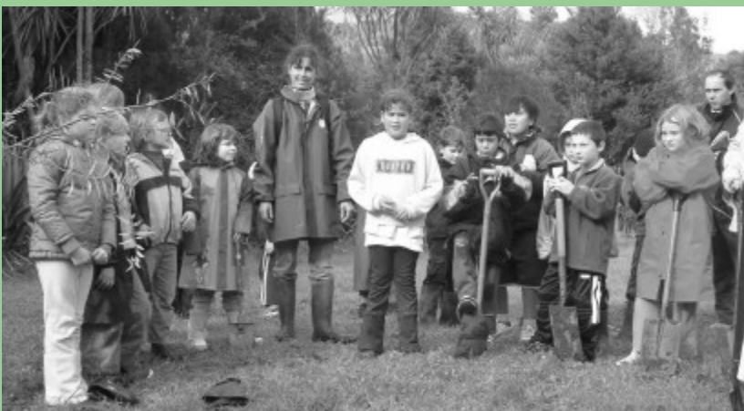
Left: The children of Parawai School planted 40 kauri saplings.