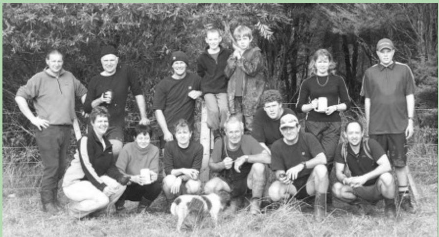
Above: the Kauri Run tree planters take a break.

ARC Adventure Racing Coromandel, which organises five events annually, set up the Spirit of Coromandel Trust and part of each competitor's entry fee is put into the Trust. The Trust's main objective is to encourage and help people of all ages on the peninsula into outdoor activities. It has sent over 30 young people from the region to Outward Bound, Outdoor Pursuit Centre and on the Spirit of New Zealand.